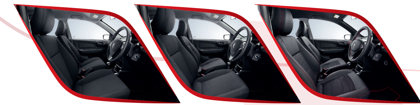
1.3L Standard AT Fabric