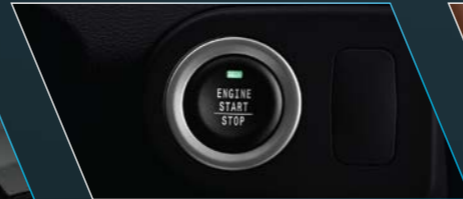
Push Start Button