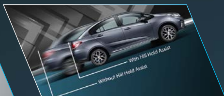
Hill Hold Assist