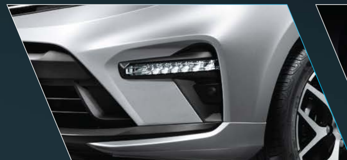
LED Daytime Running Lamps