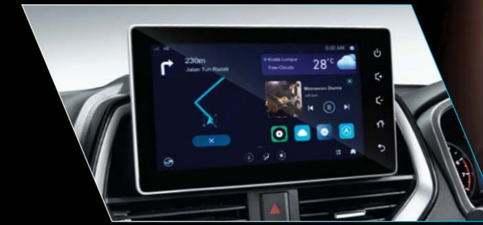
8" Floating Infotainment Head Unit

Offering connectivity that is unmatched by any other vehicle in its class, feel in command as you connect to the PERSONA for communication, navigation and entertainment options.