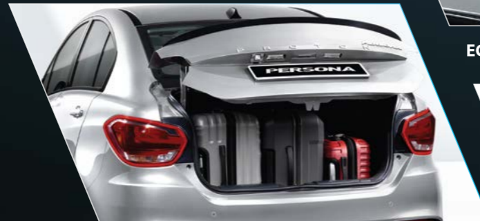
510L Boot Space