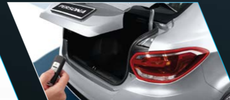
Remote Trunk Release