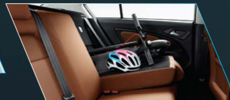
Rear Seat 60:40 Split Fold