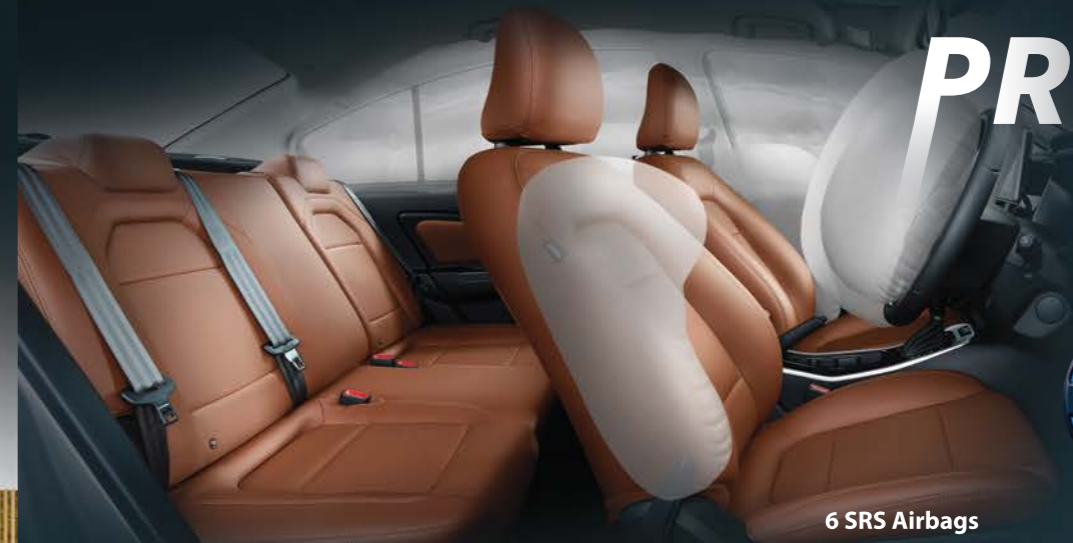
6 SRS Airbags