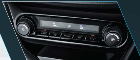
Air-Conditioning with Digital Display