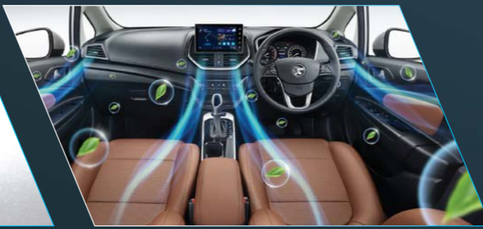
N95 Cabin Filter