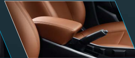
Front Armrest with Console Box