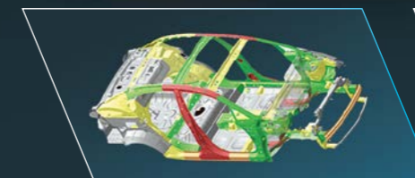
Reinforced Body Structure with Hot Press Formed Steel

Caring for you and your family is our top priority, which is why the PERSONA has a comprehensive list of safety features and a 5-Star ASEAN NCAP rating so that it can provide reassured driving enjoyment.