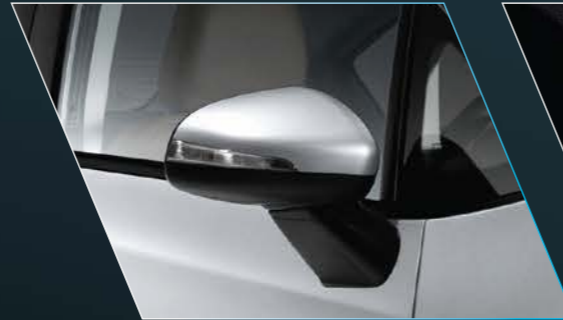
Electric Door Mirrors with Auto Fold Function