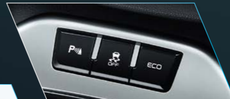
ECO Mode Switch