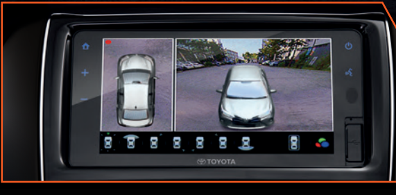
3D Panoramic View Monitor (PVM) Get a detailed 360° view of your vehicle for manoeuvring in tight spaces.