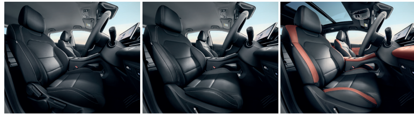
1.5TD Executive Black Fabric Seats