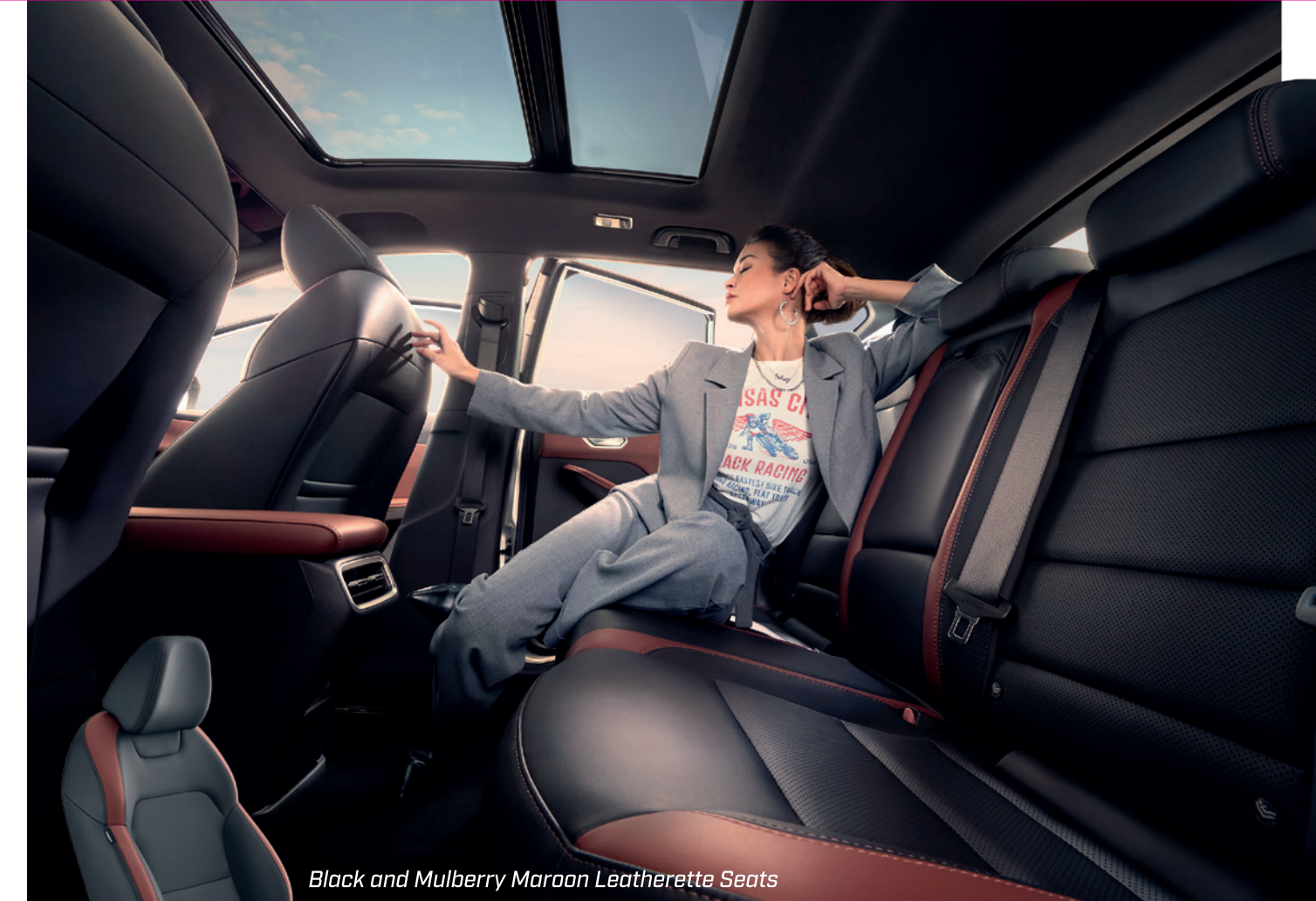
Black and Mulberry Maroon Leatherette Seats