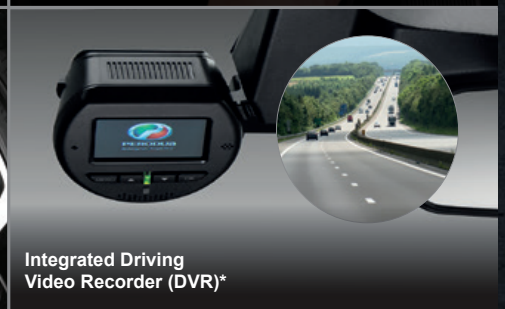
Integrated Driving Video Recorder (DVR)*