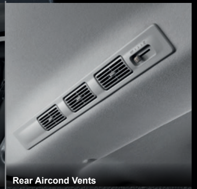
Rear Aircond Vents