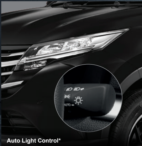
Auto Light Control*