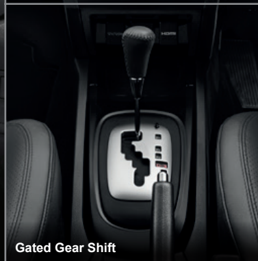
Gated Gear Shift