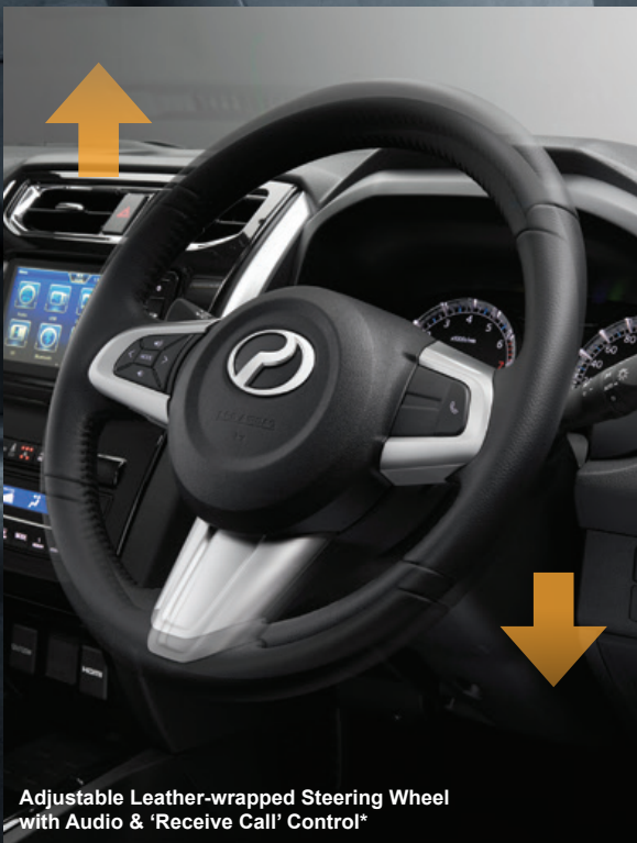
Adjustable Leather-wrapped Steering Wheel with Audio & 'Receive Call' Control*