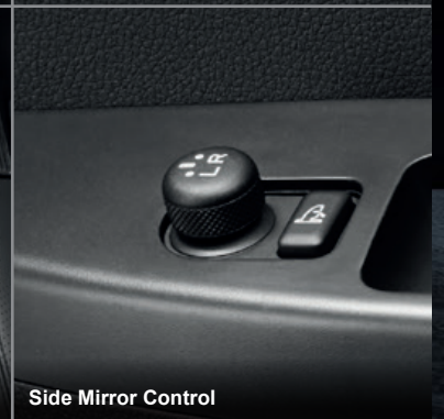
Side Mirror Control