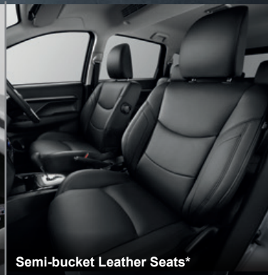
Semi-bucket Leather Seats*