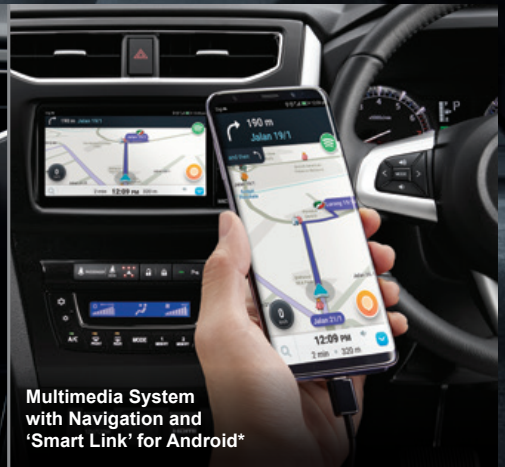
Multimedia System with Navigation and 'Smart Link' for Android*