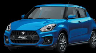
Speedy Blue Metallic