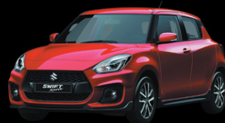
Burning Red Metallic