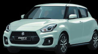
Pearl Pure White